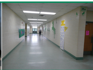
Take second hallway