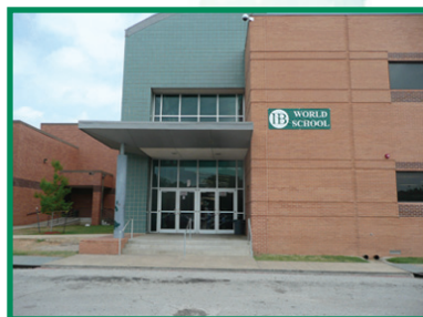
Double Door entry, south side of building