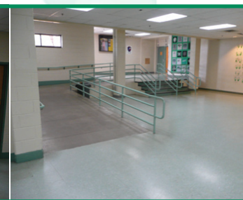
Through those doors and a few more steps to Gym B!