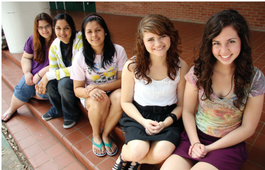
2010 Alumni Scholars

So the saying is still true: First here, best here!